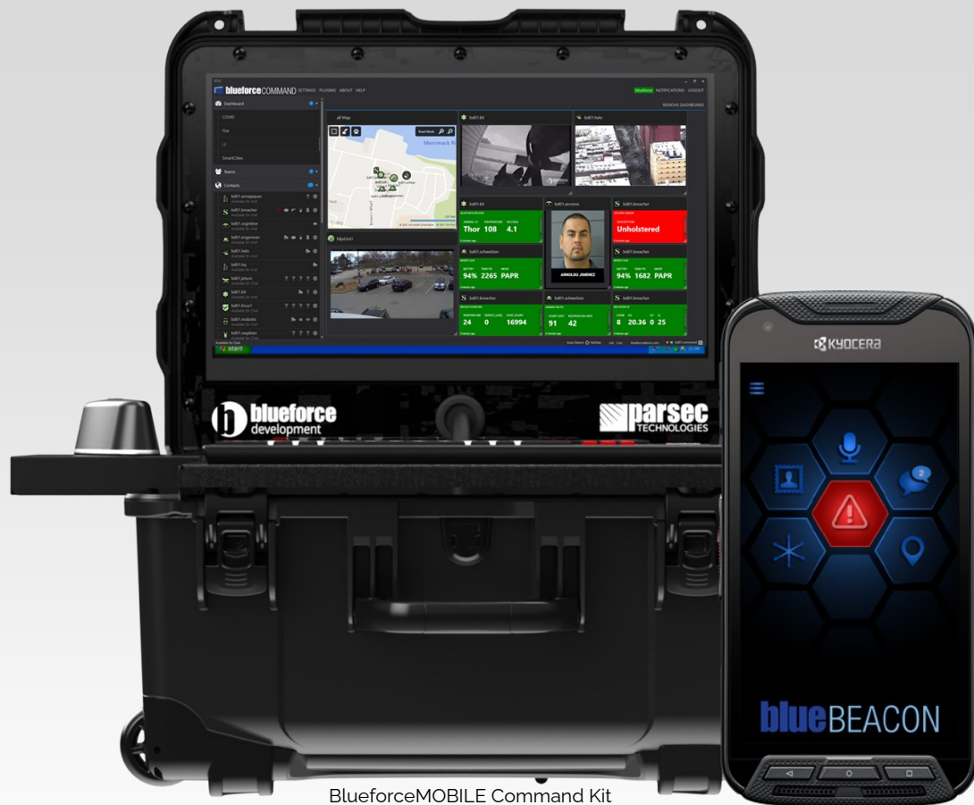
BlueforceMOBILE Command Kit